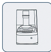
3. 3D model printing