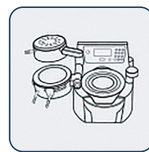
4. Compression molding of aligners