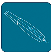
1. Intraoral data acquisition